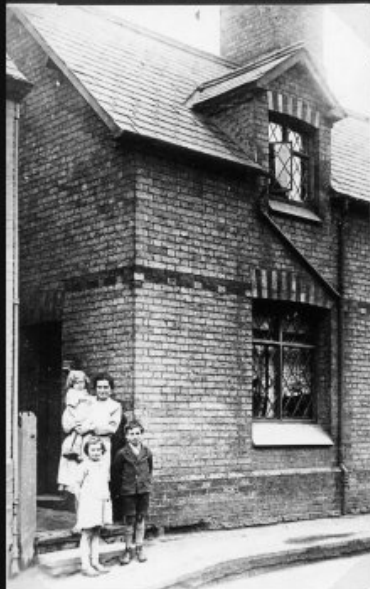
Potter's Cottages, Horslow Street