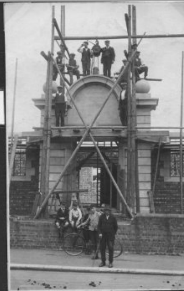
Construction of the Technical School, 1930